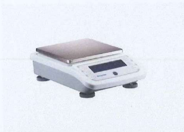
TOP LOADING BALANCE (2 units)