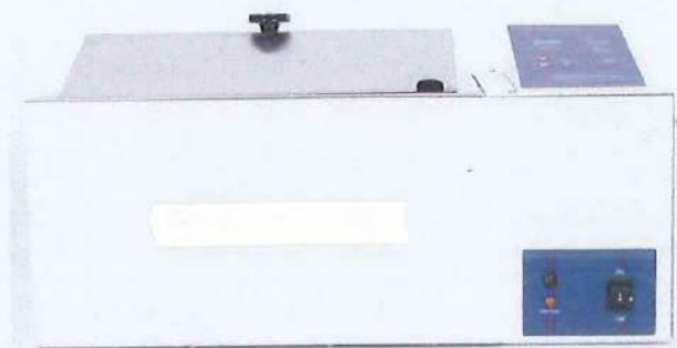
RECIPROCAL WATERBATH SHAKER (1 unit)